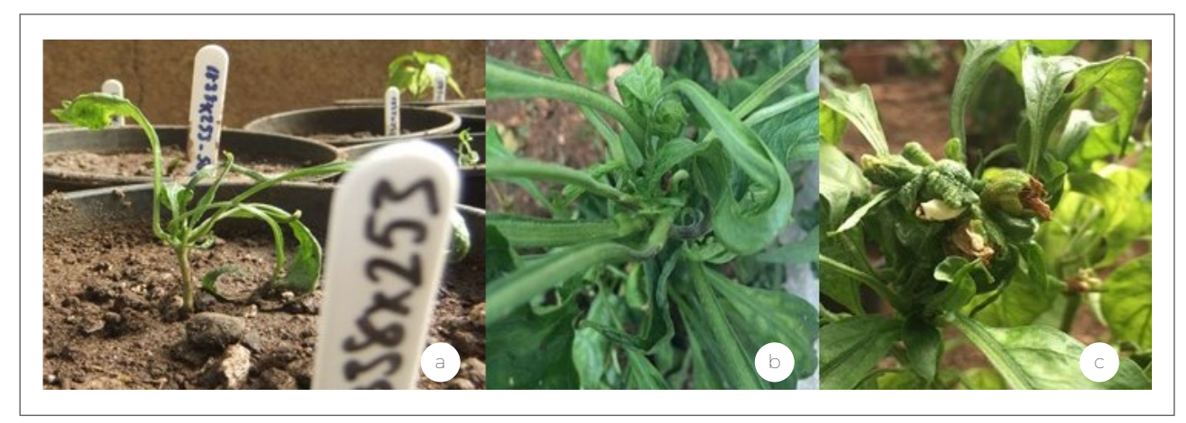
Figure 2. In the C. chinense × C. annuum hybrid combinations, the plants developed by the effects of hybrid necrosis due to post-zygotic barriers, however deformed (a: 4-5 seedling having leaves, b: the abnormal appearance of hybrid plants, c: deformed flowers). (Original)

Figure 1. Embryo rescue processes and acclimation of plants (a: the fruits harvested, b: the seeds opened, c: the plants developed from embryos, d: the plants transferred to trays, e: the plants transferred to pots, f: the plants transferred to greenhouse). (Original)