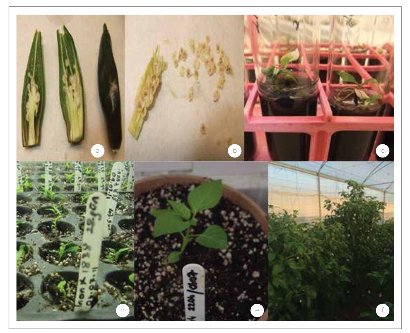
Figure 1. Embryo rescue processes and acclimation of plants (a: the fruits harvested, b: the seeds opened, c: the plants developed from embryos, d: the plants transferred to trays, e: the plants transferred to pots, f: the plants transferred to greenhouse). (Original)