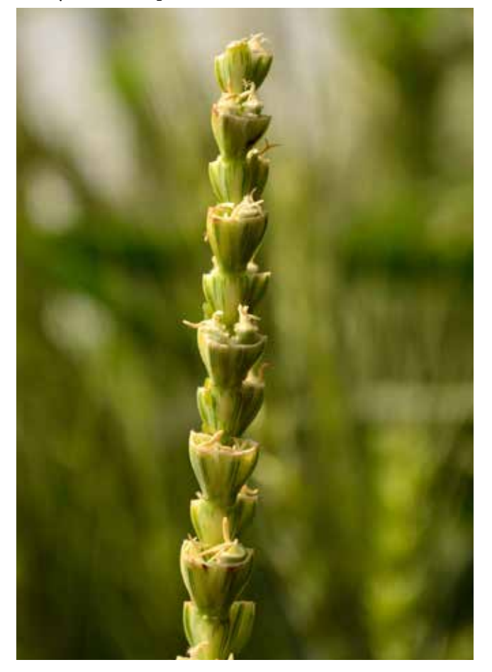
Figure 1. Development of F_1 hybrid seeds. Florets were trimmed for easy access of externally applied pollens to the stigma. Photograph was taken after removing butter paper bag, used to ensure parental identity of the hybrid seeds produced

to identify effective restorers. In the present investigation WH 542 and KRL 99 behaved as partial fertility restorers, whereas rest thirteen behaved as sterility maintainer for CMS lines WH 416A, while all fifteen pollen parents behaved as sterility maintainers for CMS lines Atilla A and PBW 445A. Comparative representation of fertility restoration and sterility maintenance in the fifteen male parents are presented in Table 4.