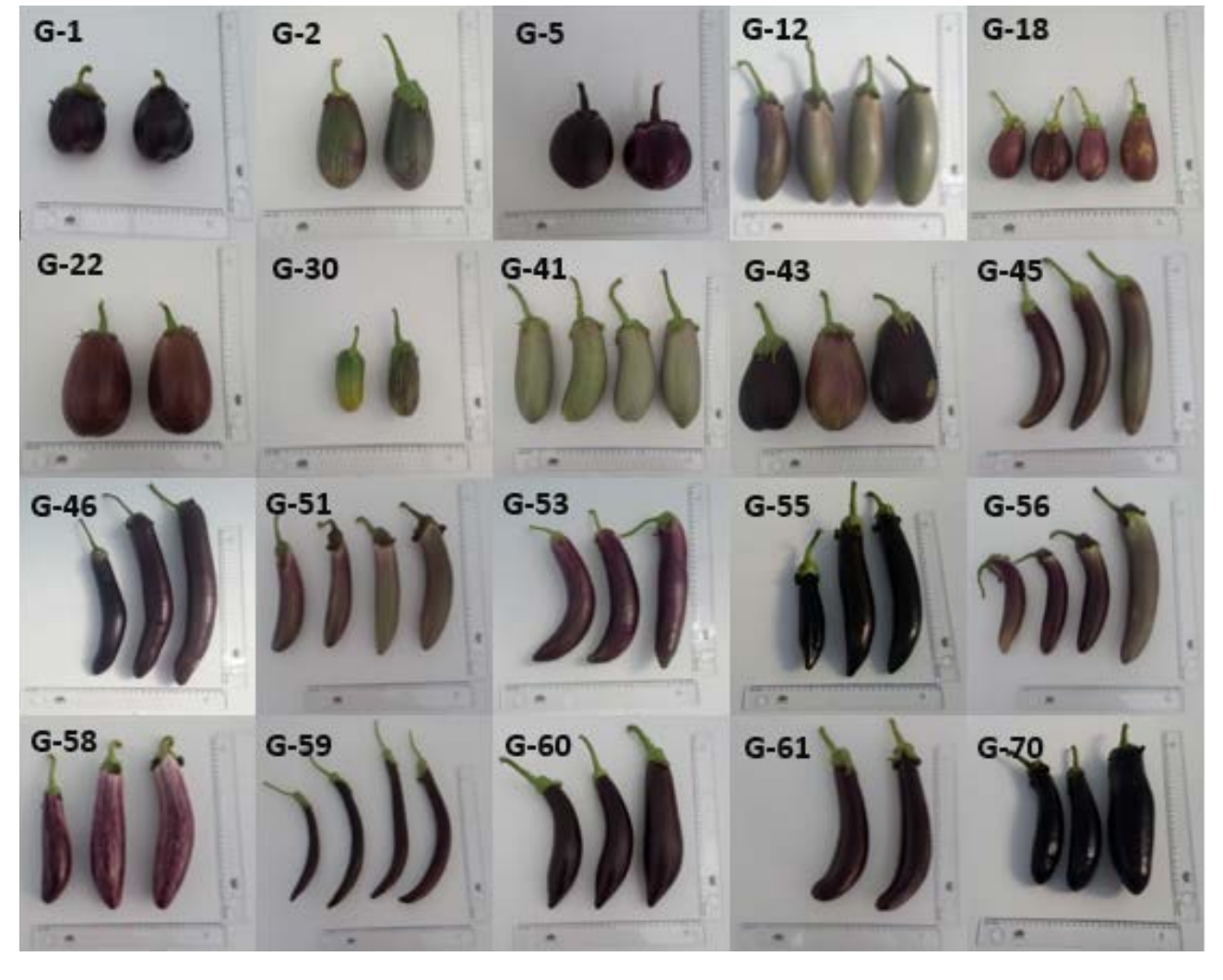
Figure 1. The view of the diversity fruit size, shape and color for Turkish Solanum melongena populations

This study is small part of a master thesis by Züleyha Çakır. We gratefully acknowledge for the support of Agriculture Faculty of Ondokuz Mayıs University.